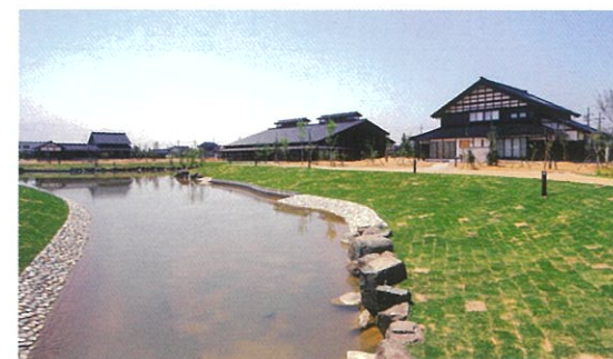
The view of Tonami Sankyo Village Museum from the recreational pond

The landscape of Sankyo in the plains of Tonami is noted to be one of the most well known Japanese rice crops villages in Japan. Tonami Sankyo Village Museum was established with the purpose to upkeep the landscape and to promote the dispersal of the local culture throughout the country. Tonami Plains Country Museum serves as a base to help stimulate the vibrancy in the district. The museum comprises of the Information Center, Heritage Center and the Community Center, where one can capture information and experience the traditional culture of Sankyo.